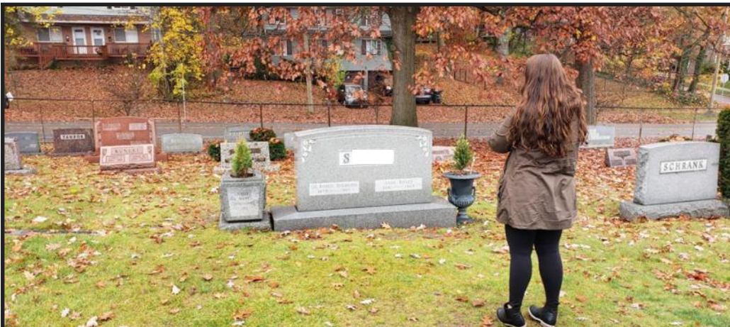
A person paying their respects at the grave of Bob and Anne S. at Mount Peace Cemetery

Thursday, the Akron Men's Big Book study group reads Bill D.'s story by his